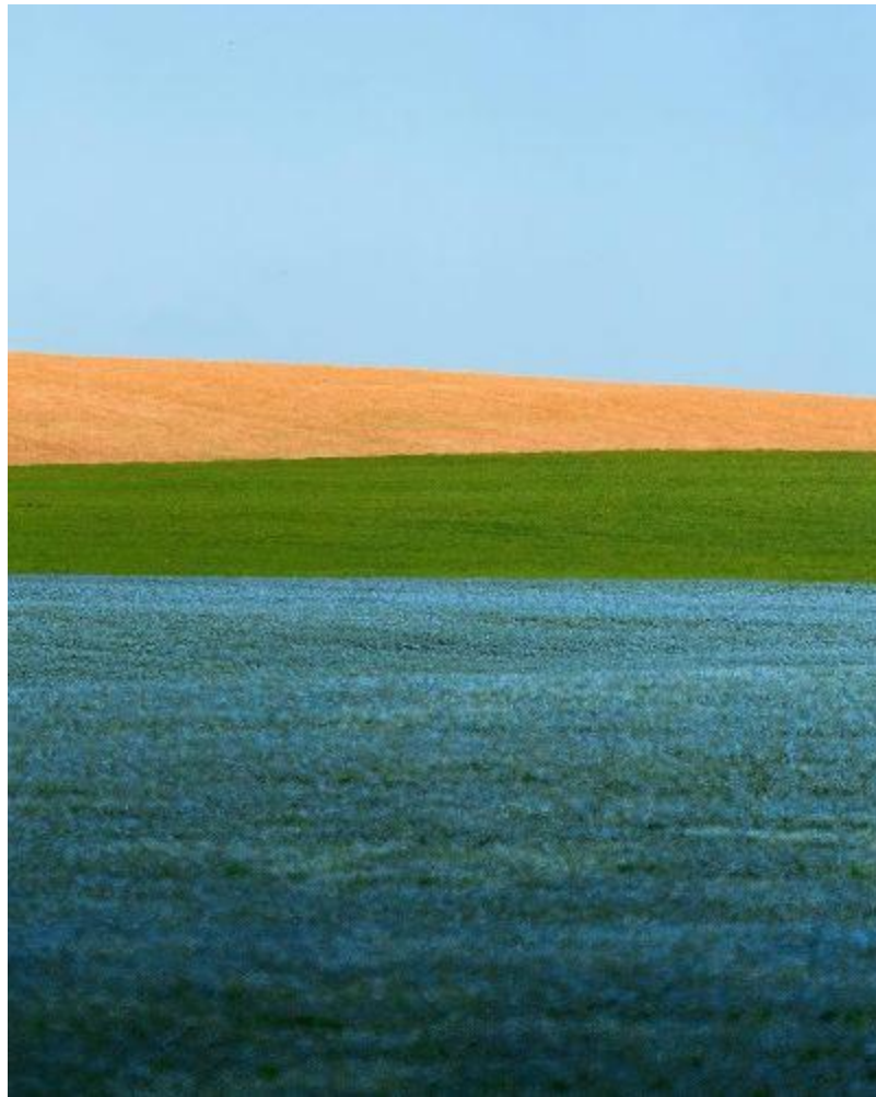
Tourism Saskatchewan photo near Coronach.

The prairies are filled with minimalist scenes with patterns and layers that are pleasing to the eye. They're commonly seen while cruising from one destination to the next. Sometimes it's the journey, rather than the destination, where you find exactly what you are looking for.